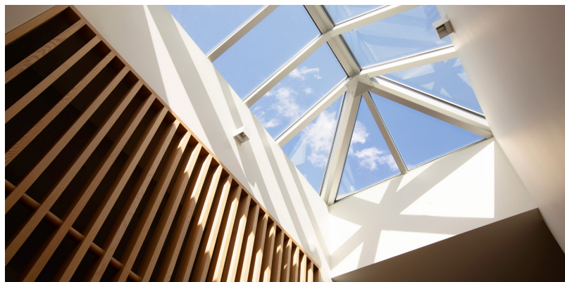
Showering light above the staircase and through fir wall slats to the kitchen, this aluminum framed, ridge glass skylight hosts a 30-degree slope with a Low E film coating.